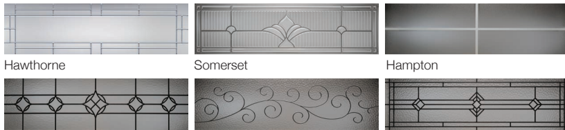
Hawthorne and Somerset shown in platinum leading; also available in brass leading.