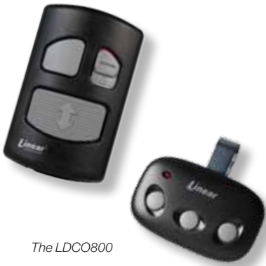
The LDCO800 includes a multi-function Wall Station and 3-button Visor Remote Control